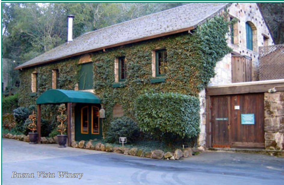
Buena Vista Winery